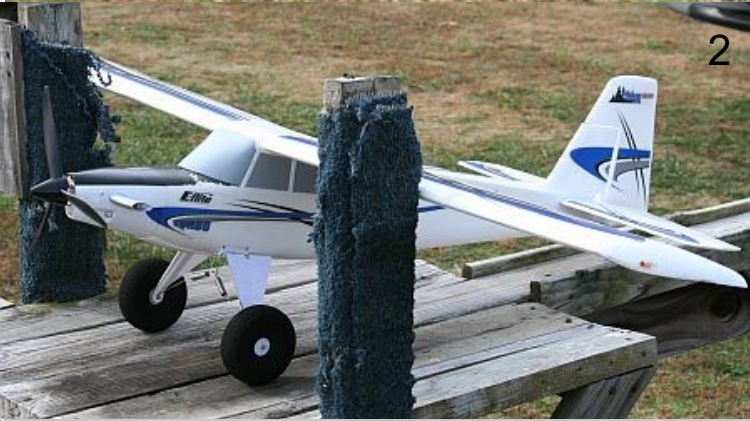
Photo 2 shows another Turbo Timber which is a great flying foamy and one of several that are flown at our field.

Photo 1 is another of Tim Sahagun's interesting projects. It is a very small drone with a very big battery, complete with GPS, camera and transmitter. It is surprising that so small a drone can easily carry that much battery weight.