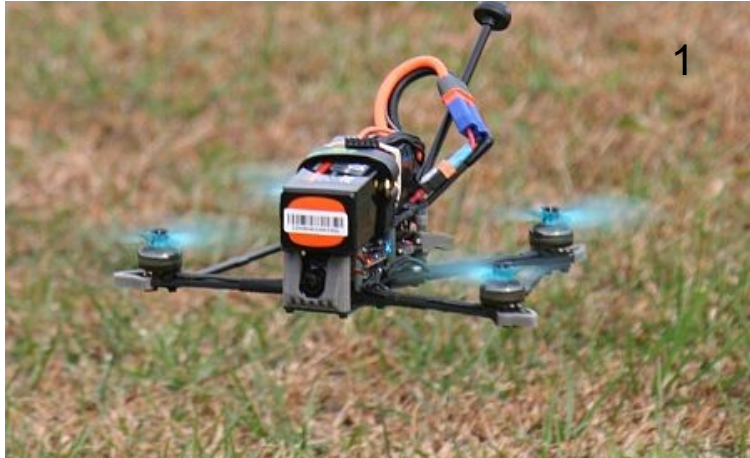
Photo 1 is another of Tim Sahagun's interesting projects. It is a very small drone with a very big battery, complete with GPS, camera and transmitter. It is surprising that so small a drone can easily carry that much battery weight.