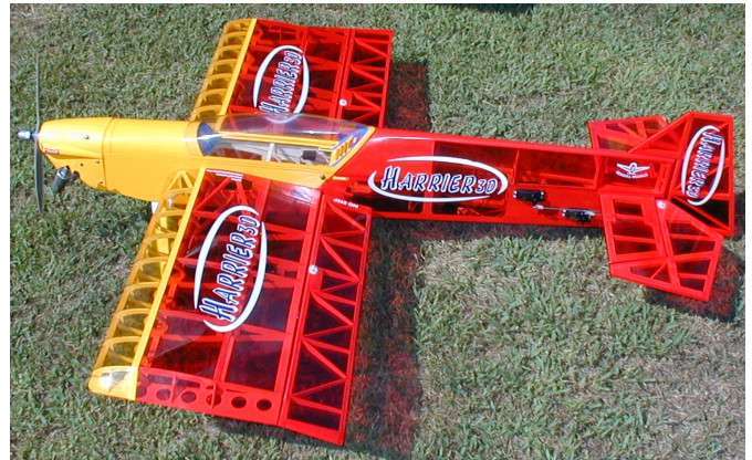
Bud Austin's Harrier 3D — very light wing & fuselage construction —

A skunk recently found itself caught in the live trap we have set up to catch armadillos. When first discovered, the little varmint was very hostile to anyone approaching within 20 feet. To avoid a very smelly situation, the little fel- low was left alone for an additional 24 hours. By then, it was quite docile, allowing Fritz Cor- bin to open the trap door without spraying smelly stuff on him. It scampered back into the woods. Fritz is hoping it finds a new terri- tory.