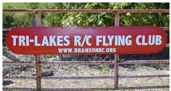
Our repainted entrance gate sign