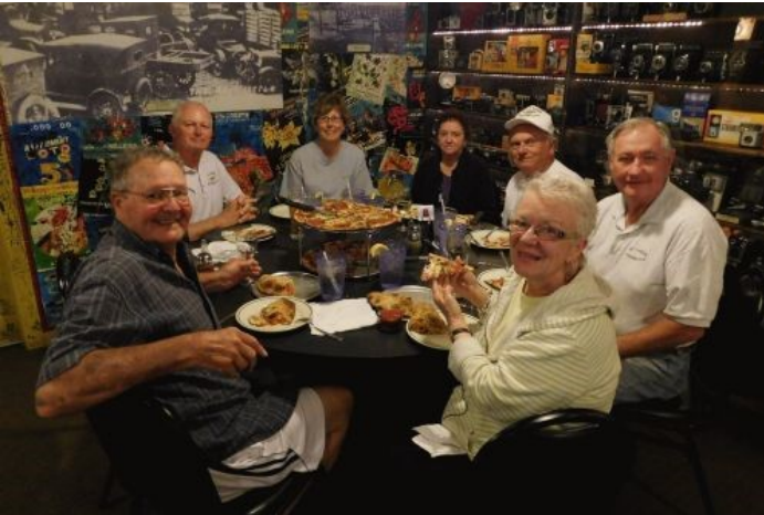
Above is the first Thursday Fly & Feast gathering at the Reeds Spring Pizza place, after an afternoon of flying. The flying was kind of windy but it looks like the pizza gathering went great.