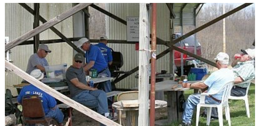
Having a relaxing lunch after the Fun Fly.

The next Fun Fly is scheduled for June 14th. Hope to see you there.