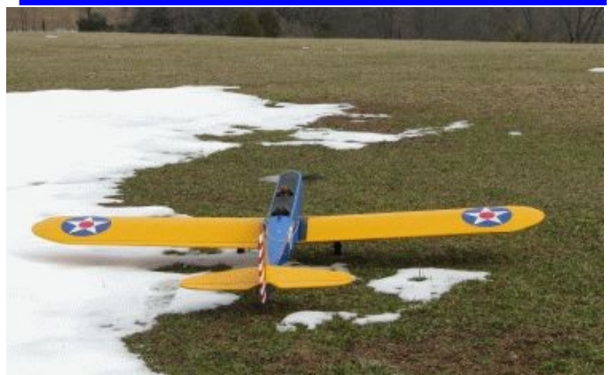
Another photo from a few years ago.

If you feel your 2016 Club dues are current but you are not on the above list contact Fritz Corbin for needed corrections.