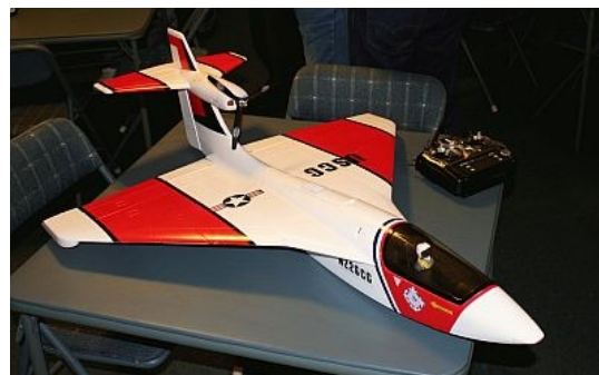
Jim Haney's new foam Polaris Ultra to replace several previous Polaris XL's.