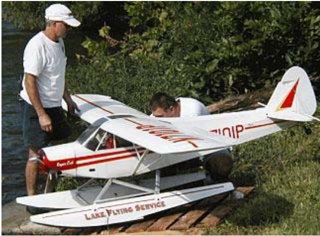
SUPER CUB 33% scale