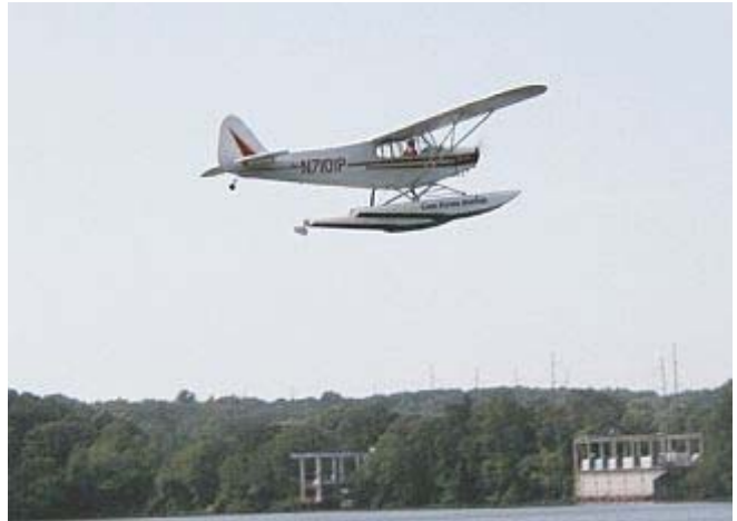
SUPER CUB IN FLIGHT