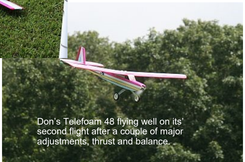
Don's Telefoam 48 flying well on its' second flight after a couple of major adjustments, thrust and balance.