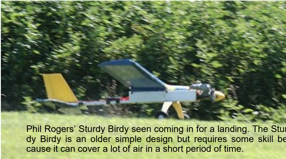
Phil Rogers' Sturdy Birdy seen coming in for a landing. The Sturdy Birdy is an older simple design but requires some skill because it can cover a lot of air in a short period of time.