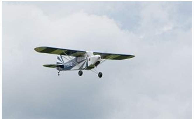
Above is two shots of Bud Austin's Sig 86 inch wingspan quarter scale clipped wing Cub. Seems to fly as good as it looks.