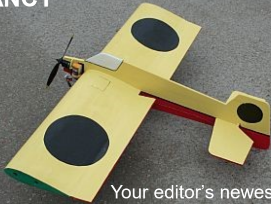
Your editor's newest project.