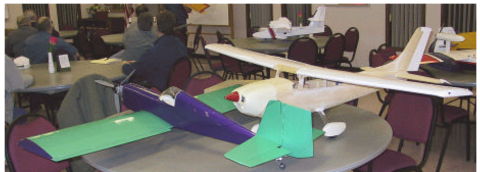
182 with a 120 Surpass engine. Ray obtained this plane at the Kansas City Swap Meet. When completed it will have a full interior, strobe lights and fowler flaps. Way in the background is Don Johnson's Canadair CL 315 fire bomber with twin Sp 400's.