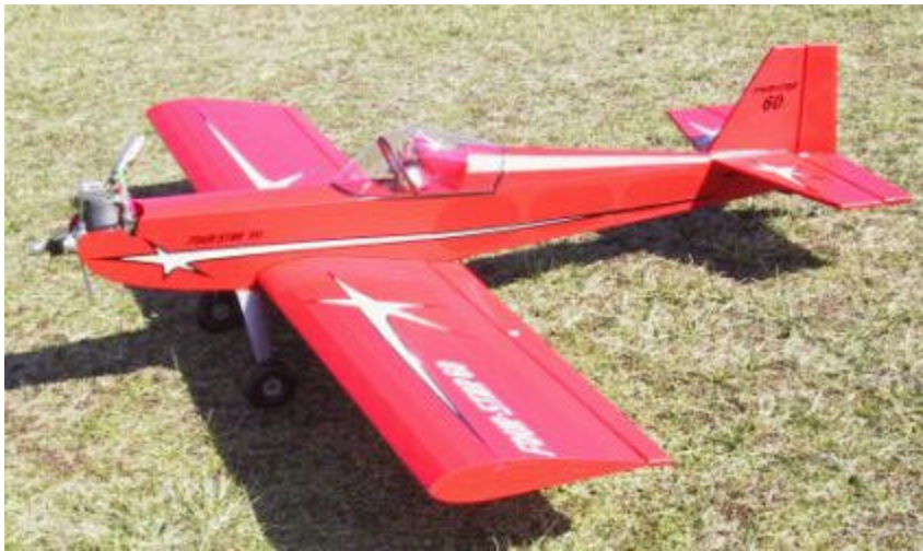
Left is Homer Zobel's new 4 Star 60. This one is decked out in red rather than the normal yellow scheme. Later it showed that it too is a great flying 4 Star.