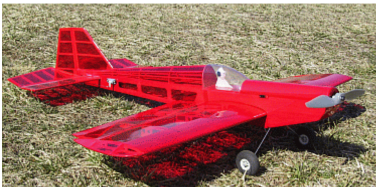
Below are a couple more of Ray Dixon's planes. The blue and green job is an Ace Bingo which Ray has mounted one of his new LCS 60 engines. This engine is sort of a 4 stroke with a piston that goes back and forth while the cylinder goes around resulting in a 2:1 gear reduction. Days later it flew very well. To the right of the Bingo is Ray's Cessna