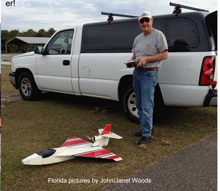
Florida