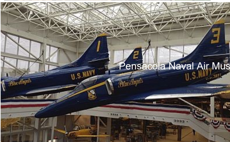
Pensacola Naval Air Museum