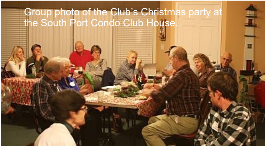
Group photo of the Club's Christmas party at the South Port Condo Club House.