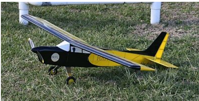
Don Johnson's new stick and tissue Pussycat. Don has built five Pussycats, two with 61.5 wingspans and then three of the 80% version with 50.4" wingspan. They have all flown very well.